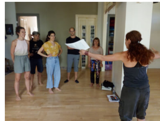
'Anthropology and Dance: Body Observation Techniques' dancefest.akropoditi.com/en/dancefest-festival-en/