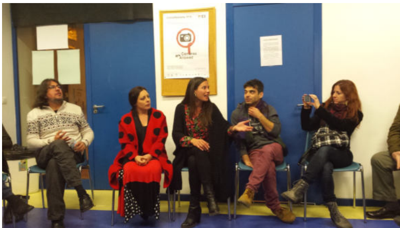
Pablo Olavide University, Seville 2018. Celebration of the 10th anniversary since the creation of the documentary.